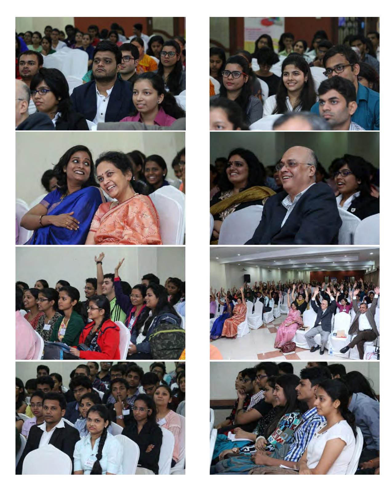
Students and Faculty actively participated in the Campus to Corporate Training Session