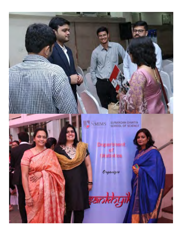
Student and Faculty Interaction