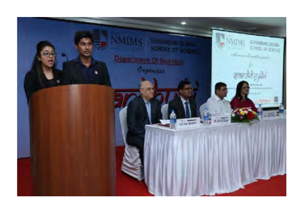
A two-day workshop "Sankhyiki" on 'Campus to Corporate: Career in Statistics and Analytics'.