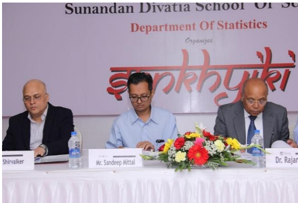
A two-day workshop “Sankhyiki” on ‘Analytical Intelligence - A Roadmap to Careers in Applied Statistics?’.