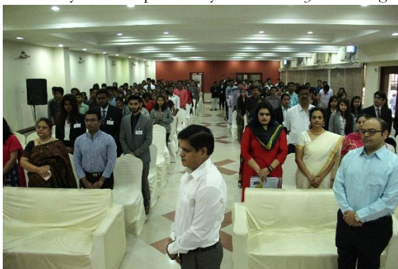
Lamp lighting ceremony, Saraswati Vandana, NMIMS Anthem