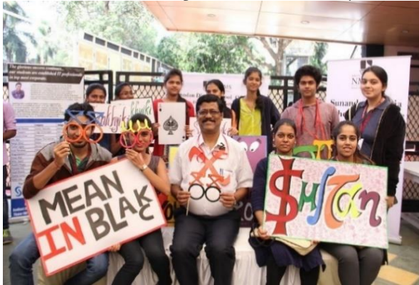
The successful Statistics photo booth created by SDSOS Student Council Creatives Department.